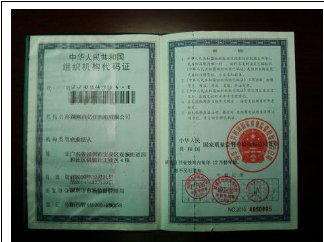
Certification & Photos -- Import and Export Enterprise Registration